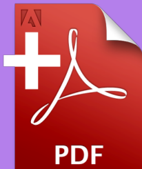
Diagram Geometry Related To Classical Groups And Buildings Ergebnisse Der Mathematik Und Ihrer Grenzgebiete 3 Folge A Series Of Modern Surveys In Mathematics

Excellent book is always being the best friend for spending little time in your office, night time, bus, and everywhere. It will be a good way to just look, open, and read the book while in that time. As known, experience and skill don't always come with the much money to acquire them. Reading this book with the PDF diagram geometry related to classical groups and buildings ergebnisse der mathematik und ihrer grenzgebiete 3 folge a series of modern surveys in mathematics will let you know more things.